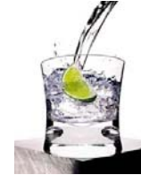
Exubera™ Chilled/Sparkling Drinking Water Faucets