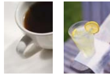
Helia™ Dual Temperature Drinking Water Faucets

The Perfect compliment to Everpure Helia Heater/Chiller Combi and Exubera Chiller/Carbonation Appliances!